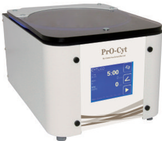
Display indicative only.